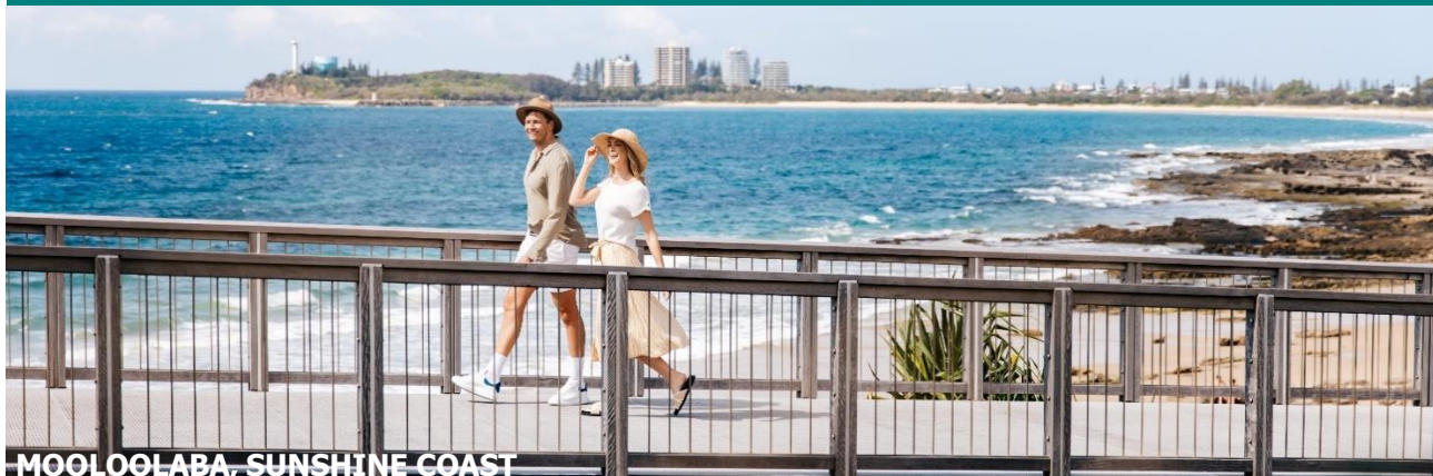
MOOLOOLABA, SUNSHINE COAST